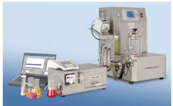
«CJ-R 1000» in combination with SMARTLiquor®

By means of the «Univision Touch S» process controller, the process by which chemicals are added is controlled in either a progressive, linear or degressive manner.