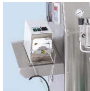
Laterally fitted automatic dosing pump