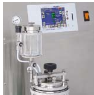
150 ml lock with regulating valve for additions