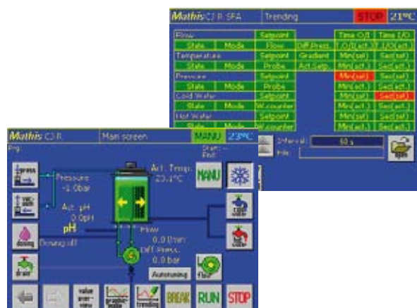
«UNIVISION TOUCH S» the clear, user-friendly process controller