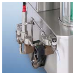
External liquor circuit / pH monitoring